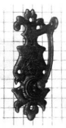
1783 5 1/2" x 2"

All cranks are fitted with electric contact