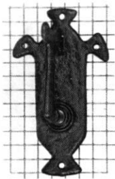
1778 6" x 3"