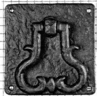
No keyhole (NK)