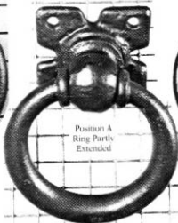
Position A Ring Partly Extended