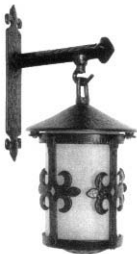
405 Lantern, Wall Bracket Three-quarter side view

Projection 8-1/2" Frame 7 x 4-3/4" Canopy diameter 6-1/4" Backplate 10-1/4 x 1-3/4" at widest point.