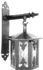
407 Lantern, Wall Bracket

Narrow backplate requires our Narrow Junction Box #M512.