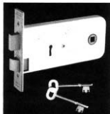
M349 Same case as M492 Latch